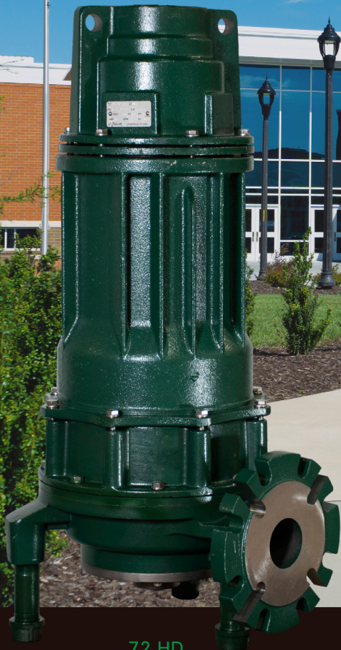
72 HD, 3" discharge