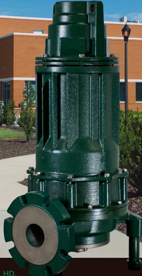
72 HD, 4" discharge

72 HD, 10 & 15 HP Horizontal Flanged Discharge 3450 RPM