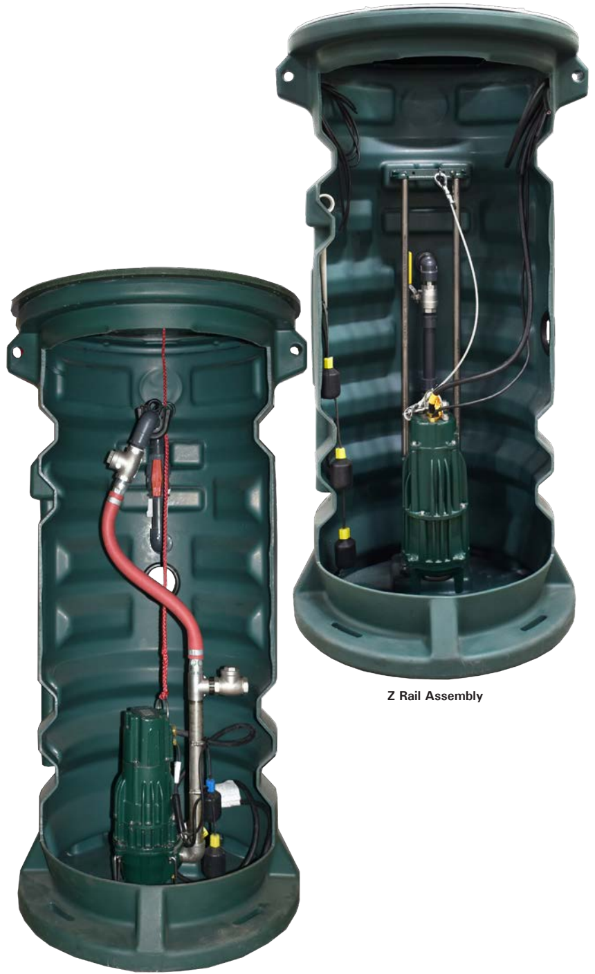
Z Rail Assembly