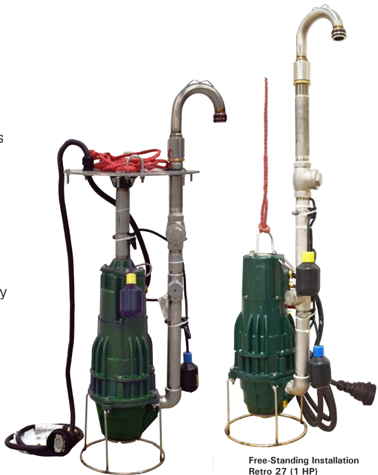
Cover-Mounted Installation 1 and 2 HP