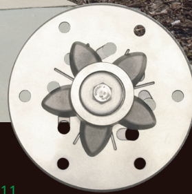
7011 reversing cutter and plate